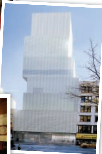
The New Museum on the Bowery Credit: Design + Visualization: Sejima + Nishizawa / SANAA Site Photography: Christopher Dawson