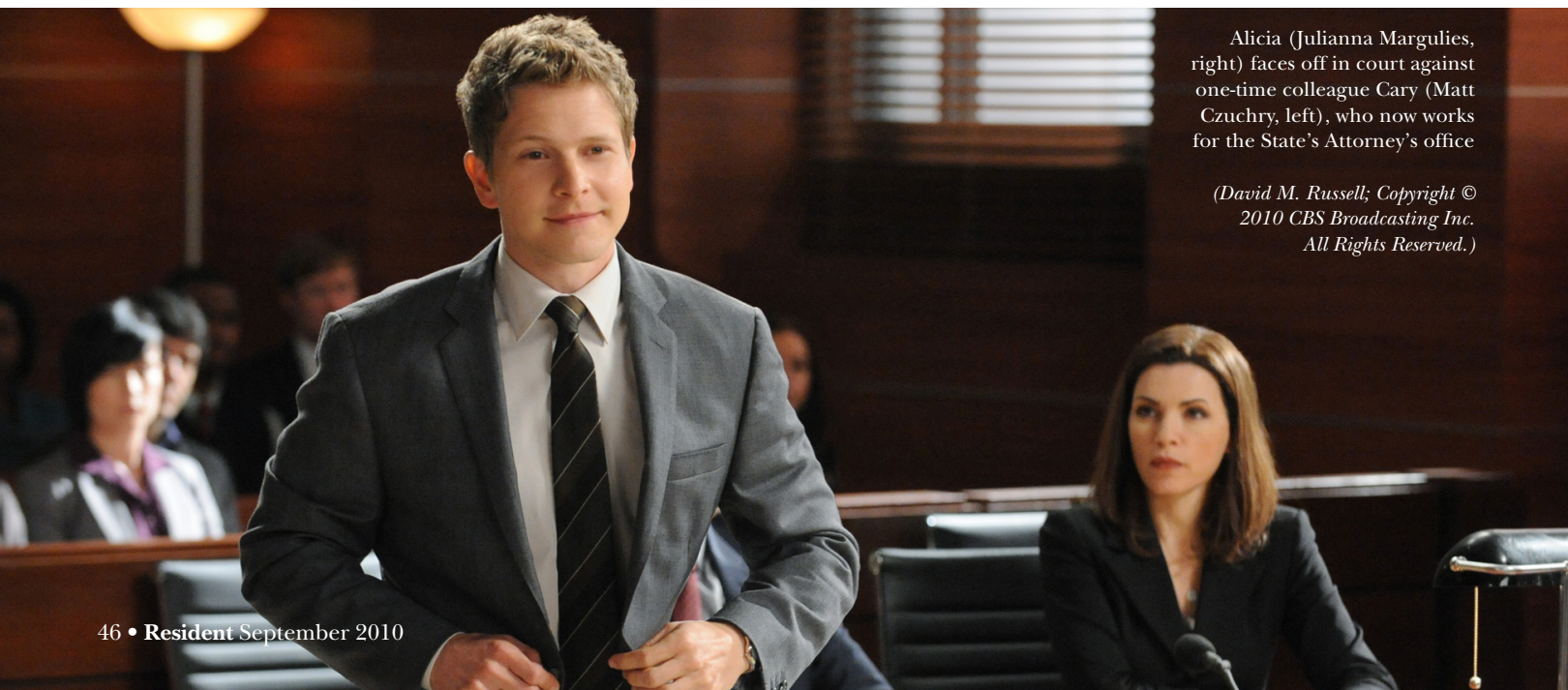
Alicia (Julianna Margulies, right) faces off in court against one-time colleague Cary (Matt Czuchy, left), who now works for the State's Attorney's office