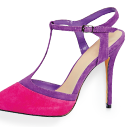
Pleaser, $80, shoebuy.com