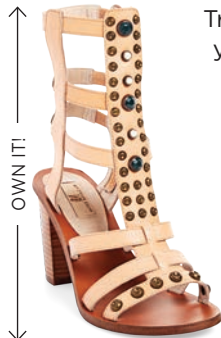
Mia Limited Edition sandals, $209, dailylook.com