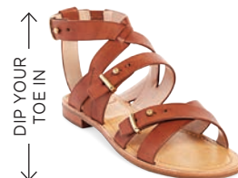
French Connection sandals, $115, zappos.com