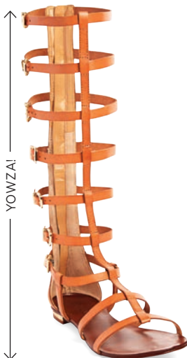
Schutz sandals, $260, zappos.com