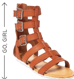
Bamboo sandals, $31, lulus.com